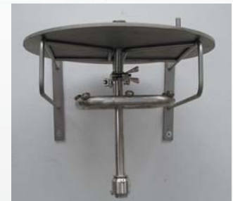
(2) manual washing head