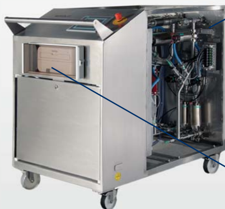
(1) washing station

Rack for preparation of media supply, detergent handling and blowing out