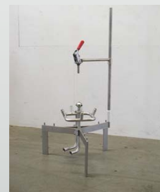
(5) washing device for drum