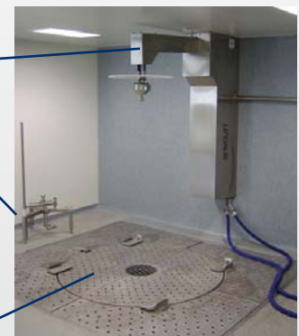
(3) (4) washing place with lifter for washing head

Turn table manually driven for simplified outer washing